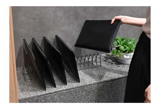
With its slim profile, it stores compactly, saving space efficiently.