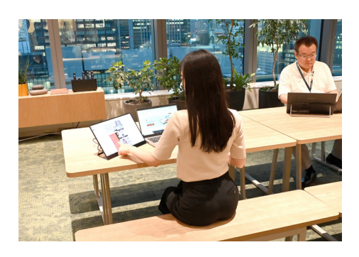
Touch operation enhances work efficiency.